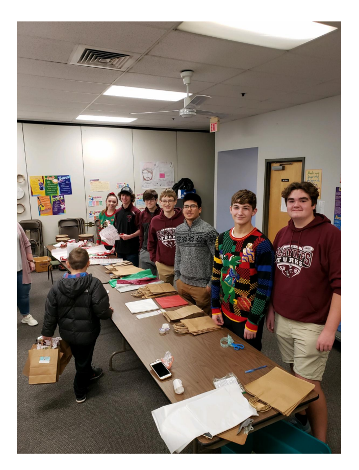
The HAPPY wrappers from THS Student Council